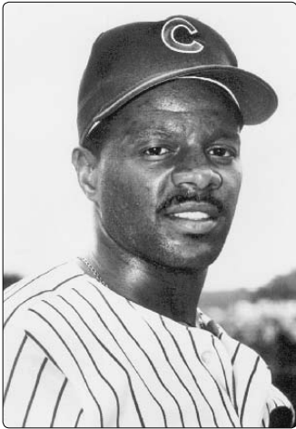
Cedric Landrum (Outfielder) Chicago Cubs New York Mets